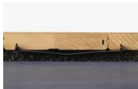
A cross section of a floating clip floor on a 10 mm underlay.