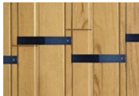
The clips hold the boards together - on the back of the boards.

There are two construction heights for a Junckers CLIPsystem sports floor: 27 mm when the CLIPsystem floor is installed over an existing resilient sports floor; and 32 mm over a concrete subfloor and harder sports floors. This is due to the different thicknesses of underlay required for each type of subfloor.